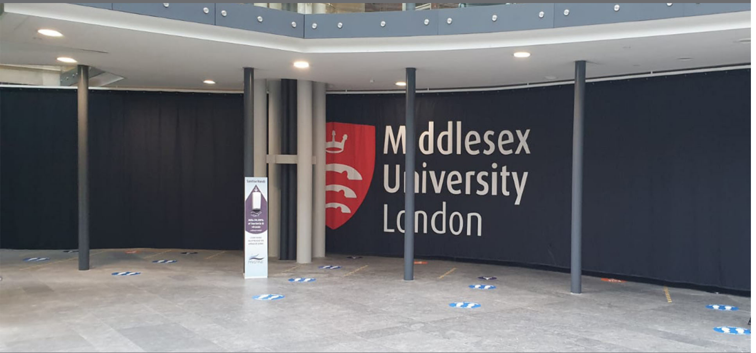
Products provided by Bridge were: 20m Bespoke Printed Curtain on Made to Measure High-Grade Aluminium Cubicle Track.