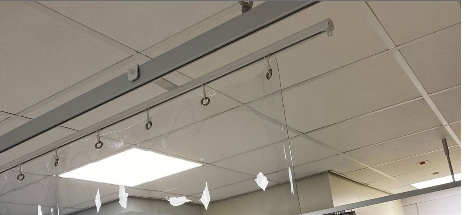
Products provided by Bridge were: CubiScreen ® and CubiTrack ®.