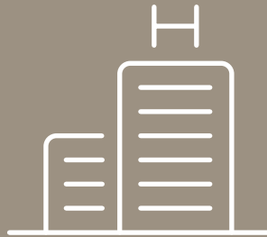
HOTELS & LEISURE